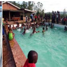
Dance & Drama